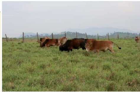
Fig. 2: Cattle grazing on B. ruziziensis pasture